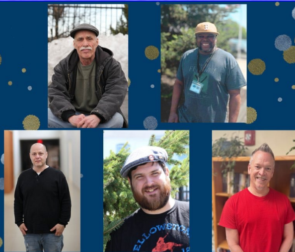
2024 Men's New Life Graduates